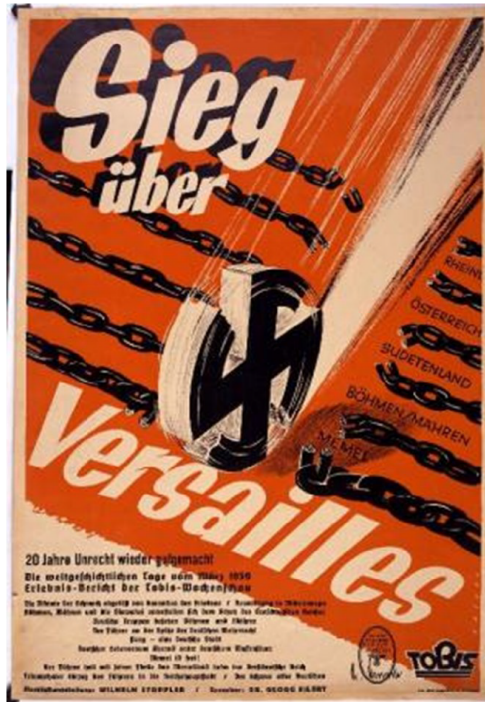
“Victory over Versailles.” 1939. Wolfsonian