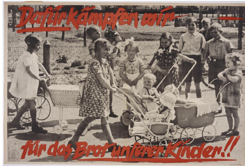
“Why We Fight—for Our Children’s Bread! March 11, 1940.