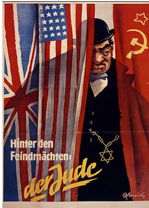
“Behind the Enemy Powers: The Jew.” 1942.