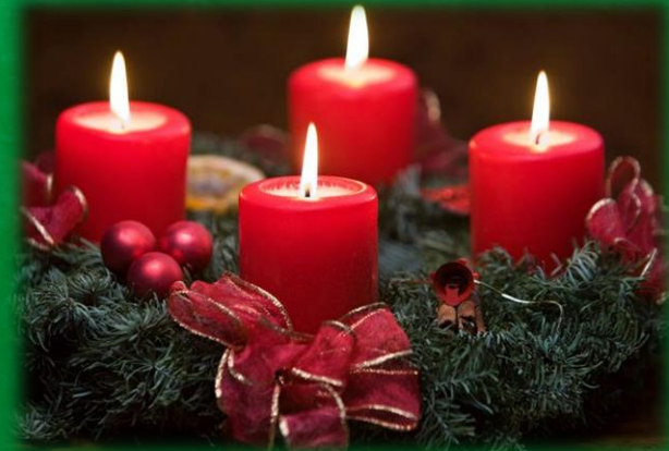
Clockwise from top left: grapevine-wrapped gift, lapel pin, atole de chocolate, empanadas, nativity with moss, advent wreath and candles, red wool coat, midnight mass