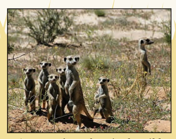
A group of meerkats in the wild