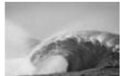
Waves and Tides