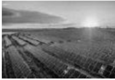
The Sun (solar)