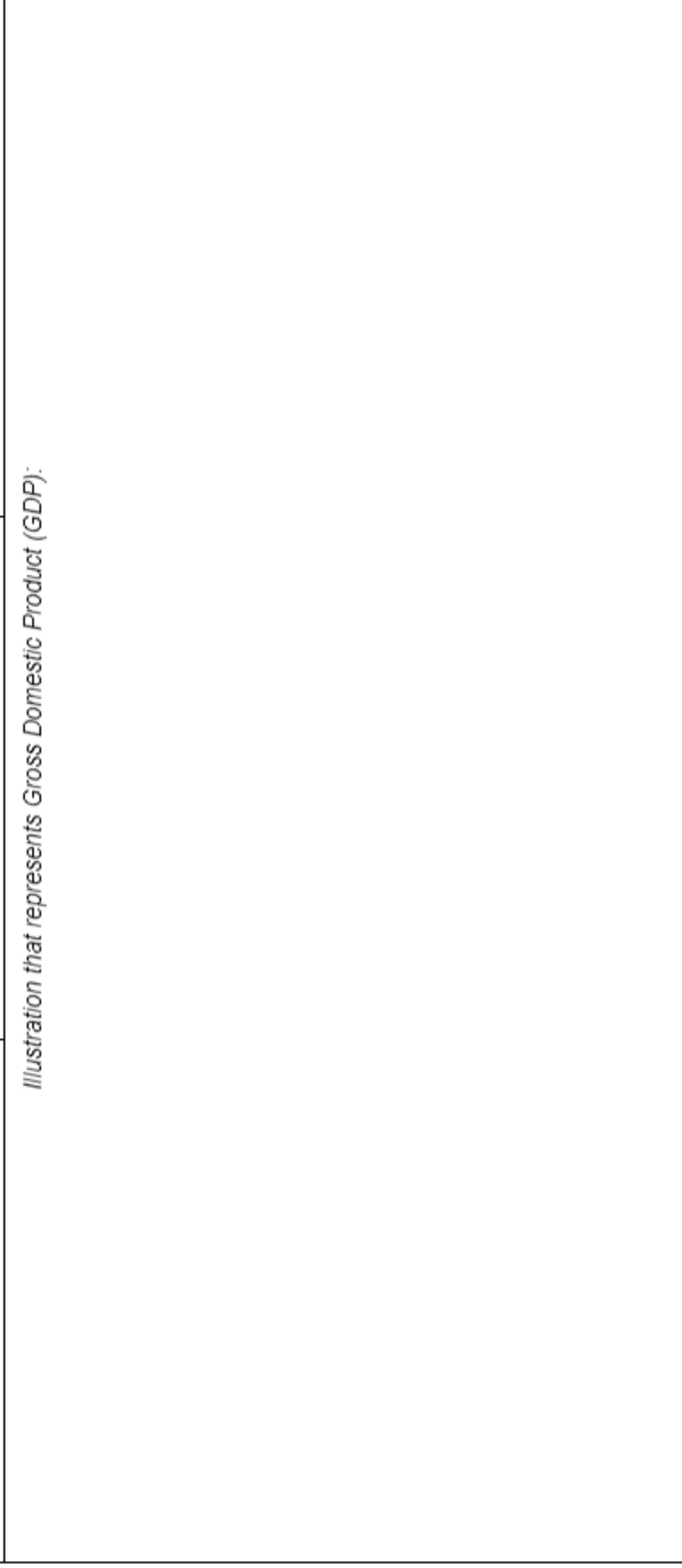
Illustration that represents Gross Domestic Product (GDP):