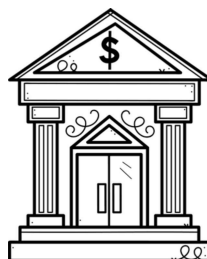
SAVINGS & LOAN COMPANY